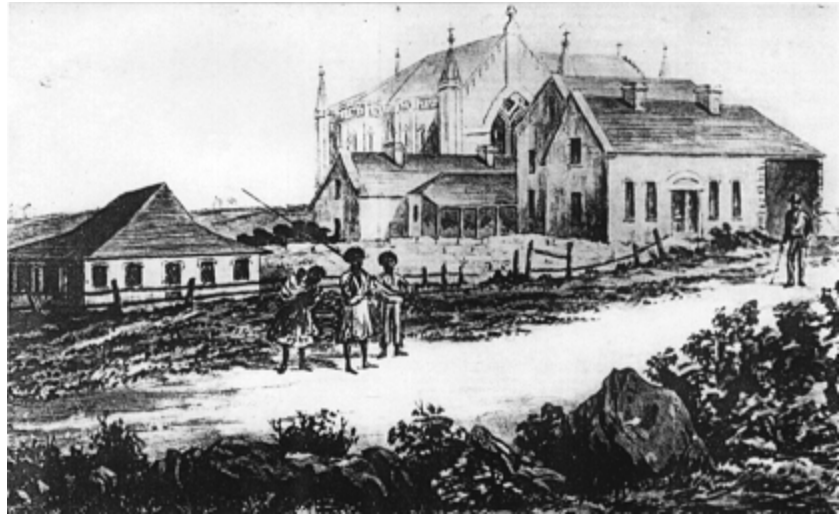
St Mary' s Chapel in the background in this Sydney street scene of 1836 395