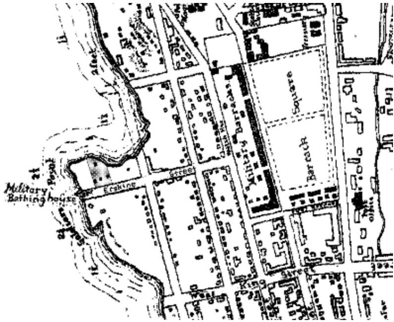
Sydney Town near Erskine Street in 1836, (Between Military Barracks and Military Bathing Area)