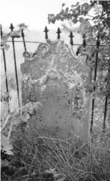
David' s grave as seen April 2001