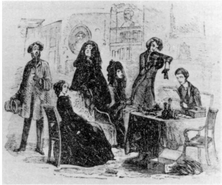
Cartoon ‘Reading of the Will’ – 1854 695