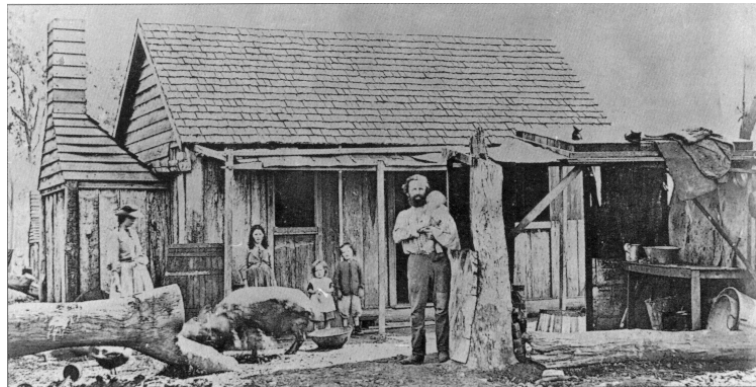
A timber house indicative of the pioneer homes of the 19 th century. This photo is of a home in the Daintree area Queensland 1869.