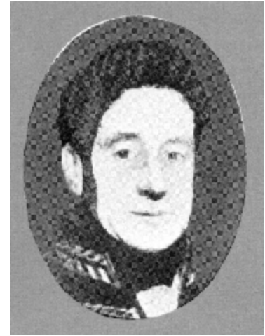
Colonel Lachlan Macquarie (1761 – 1824) Governor NSW 1 January 1810 to 1 December 1821.

The Hawkesbury was the colony's 'breadbasket', and so Macquarie was at pains to assure them of his intention to assist them. He personally investigated their circumstances, and set in train measures to aid the development of the Hawkesbury area including the creation of the five towns.