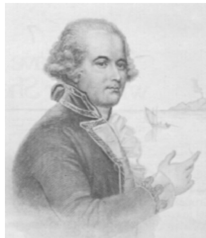
Captain William Bligh (1754–1817) Governor of NSW. 6 Aug 1806 to 26 Jan 1808